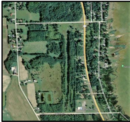
south between Heinemann Rd and Rubicon Rd

FLY-IN AT AIRPORT HOPE DRAWS HUGE CROWD The annual fly-in and pancake breakfast held at Airport Hope on Sunday, August 15, drew one of the largest crowds in its history. Even the slightly colder temperatures didn't put a damper on the events, and the Chamber of Commerce report serving breakfast to a record number of people. Members of the Flying Club were busy until early evening, taking care of all the requests for airplane rides. A large number of door prizes were given away, donated by the merchants in Port Hope. Bomb dropping was demonstrated and model airplane flying by remote control.