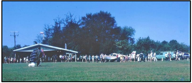
Typical Fly-in held at the airfield, drawing huge crowds and creating a fun-filled day

In 1958 Vic cleared property on his Port Hope land and constructed a 2,000 ft. grass runway. Included was one enclosed hanger and one open covered shelter. Vic now had the luxury of being able to fly to work in Bad Axe taking only a few minutes. It didn't take long for the Air-Port-Hope to become a very popular place. For years it was an active location for additional aviators, flying clubs and a regular occurrence of week-end "fly-ins" with pancake breakfasts, airplane rides and entertainment.